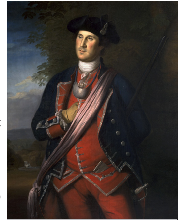
Portrait of George Washington by Charles Willson Peale, 1772

General Braddock died three days later. George Washington would conduct a funeral for him, reading Scripture and offering prayer. Of the 1,300 British soldiers, 456 were killed, 422 more wounded, and 63 of the 86 officers were wounded, with 26 dying. Of the 50 women who had come along as maids and cooks, only 4 made it back – half were killed, the other half taken prisoner. The French only had 27 killed and 57 wounded.