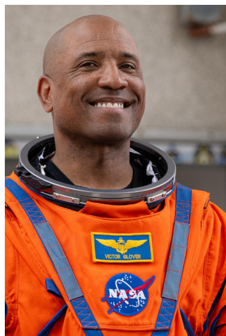
Artemis II Pilot Astronaut Victor Glover

NASA (National Aeronautics and Space Administration) has been focused on having a prolonged presence in space with the work of the International Space Station (ISS), so until recently lunar exploration took a backseat. The Artemis missions of NASA have changed that. They began with the first launch in 2022 when an unmanned spacecraft orbited the Moon and returned successfully for the first time since Apollo 17 in 1972. The plan for the Artemis program is to establish an ongoing manned presence on the Moon. In upcoming missions astronauts will return to the surface, marking another generation of Moon exploration. As we press forward, may we never forget the sacrifice of many lives throughout our ongoing space program, and may we remember it is only possible by the ordered design and engineered forces at work in creation by the Lord God our Creator.