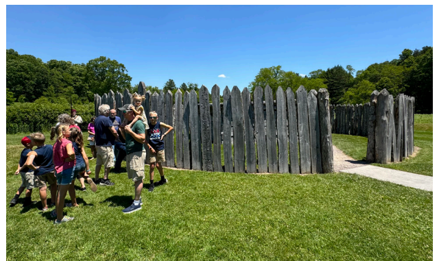
Fort Necessity, also known as the Battle of the Great Meadows

When the French found out, they were very upset and sent soldiers to attack Washington, led by the murdered commander's brother. The French and Indian force of 600-700 attacked Washington's forces of nearly 400 on July 3, 1754 at about 11:00 am. The battle continued until 8:00 pm. A heavy rain had flooded the trenches Washington's men had dug, so they had to fire over the fort's walls, mostly shooting over the enemy's heads. The Indians, though had climbed up into trees and were shooting down into the fort.