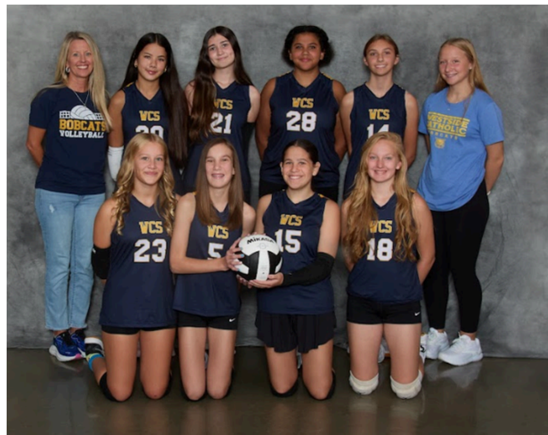
A nice picture was shared of our 7 th /8 th grades volleyball team