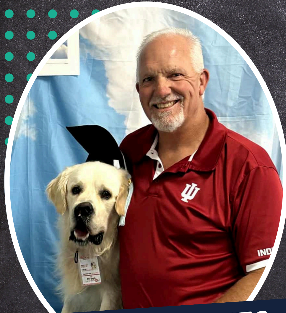
STEVE RICKETTS GYM & HEALTH