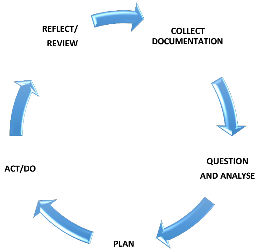
Diagram: The early years planning cycle adapted from the Educators Guide to the Early Years Learning Framework for Australia (2010, p.11).