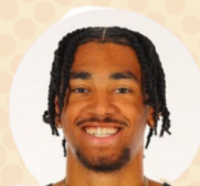
DOM US Intern U of Cincinnati