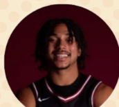
KOBE US Intern Central Washington U