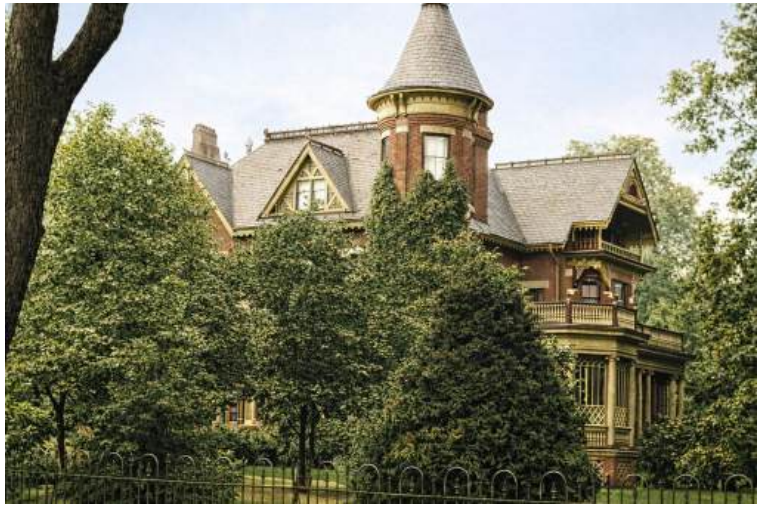
Lawnview Mansion (16 Melville Street – until 1961)

He also donated land and funds for public landmarks such as the site for the Carnegie Gallery, and the Dundas Driving Park.