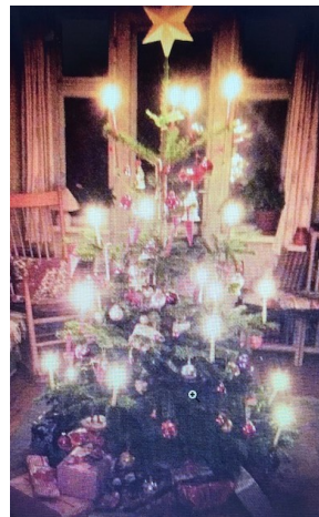
A Danish Tree with Real Candles!