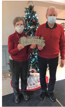
Before, during & after...