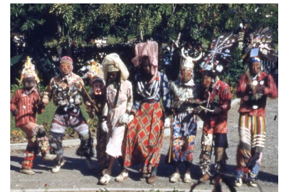
jonkunno —circa 1954