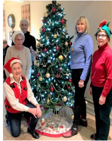
During and after...