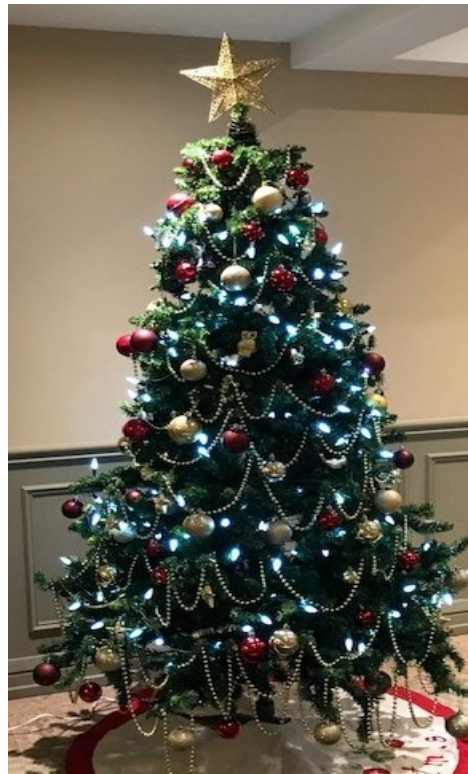
We may not all celebrate Christmas but we can all rejoice in its spirit