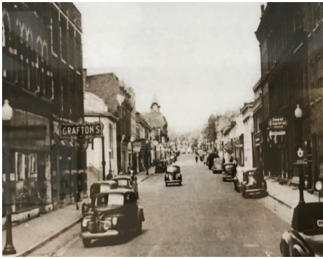
Grafton's The Shop