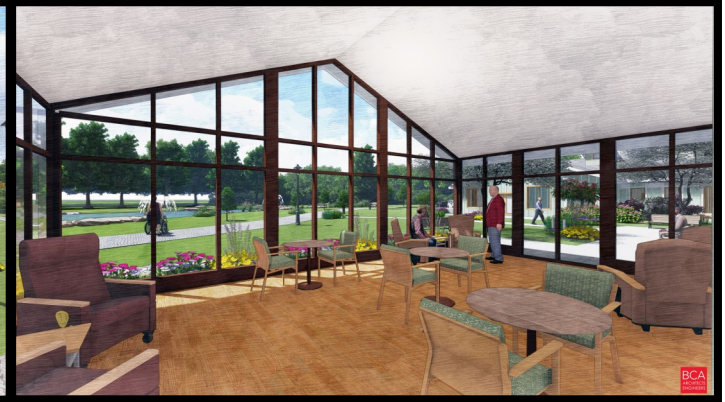
Interior view of Hospice Solarium and inner Healing Garden

We are well on our way to making this vision become a reality! Hoping to raise $1.4 million over the upcoming year, everyone at Hospice is excited to begin the next phase of this capital project.