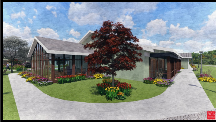
Exterior view of the new Hospice Solarium and Walkway