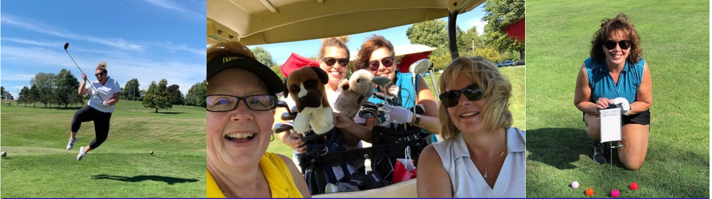
Team Key Bank enjoying a beautiful day of golf at Ives Hill Country Club all to support Hospice

THANK YOU. Your generosity allows Hospice of Jefferson County to serve patients with a life-limiting illness and their families.