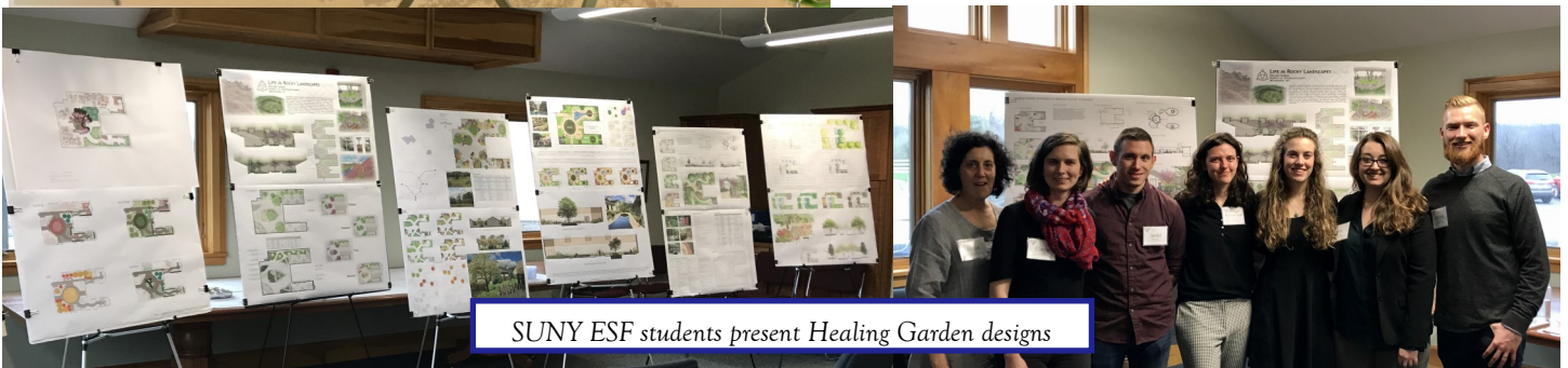
SUNY ESF students present Healing Garden designs

Gardens remind us of the patterns in life and the natural stages of growth. They comfort the soul with the knowledge that all things, all beings, follow a natural pattern of growth, decline and rebirth. We are so grateful for the support from our Garden Committee and the community that will soon make this garden a reality.