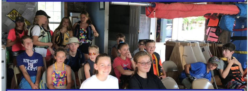
Junior Division sailors meeting before setting sail for the 2019 Hospice Regatta. They raised over $3,600 for Hospice.

Thank you to Pond Pit BBQ & Jodi's Dairy Bar for supporting Hospice's Christmas in July Party