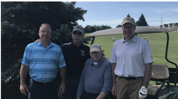
The Pike Crusaders heading out for a day of golf at the 2019 Swing for Hospice Golf Tournament.