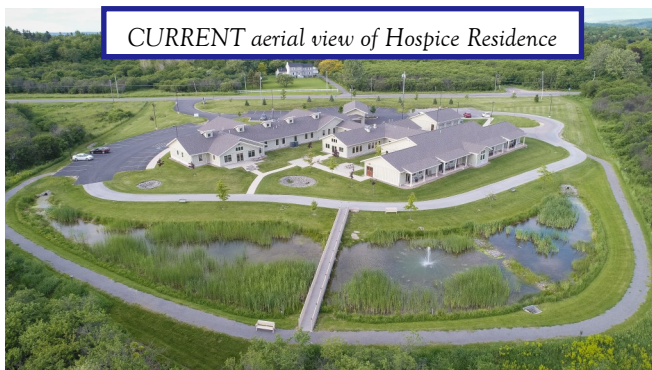
CURRENT aerial view of Hospice Residence

We are fortunate at the Hospice Residence to be surrounded by a natural open landscape, a pond, fountain, the Bannister Bridge, and the Mary Macsherry Reflection Garden. This special environment invites patients and families to go outside, take a walk, sit on a bench and observe the birds, deer and other wildlife that wander in from the woods and wetlands and to just enjoy the beauty and tranquility. Being a part of nature helps reduce pain, discomfort and distress.