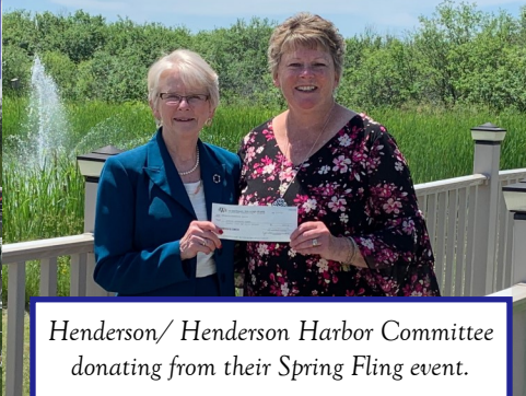
Henderson/ Henderson Harbor Committee donating from their Spring Fling event.

NYSCOPBA giving Hospice their annual donation.