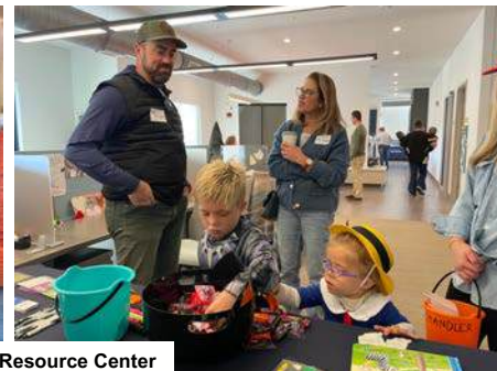
Halloween Event @ VIPS Family Resource Center