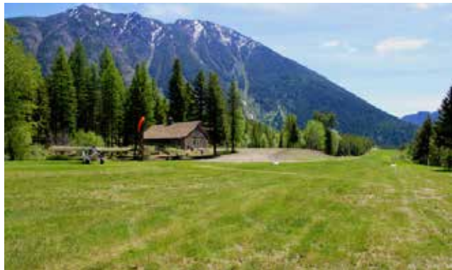
Simulated position of barn at Ryan Field

If you’ve seen scenic, remote Ryan Field near Glacier Park, Montana you’ll understand why the RAF has embarked on a vision to restore its backcountry appeal, while adding to its amenities. Visitors enjoy the rustic pilot shelter, vault toilet and solar shower enclosure along the west side of the airfield. They can cook on the wood cookstove, tap plenty of delicious well water and get out