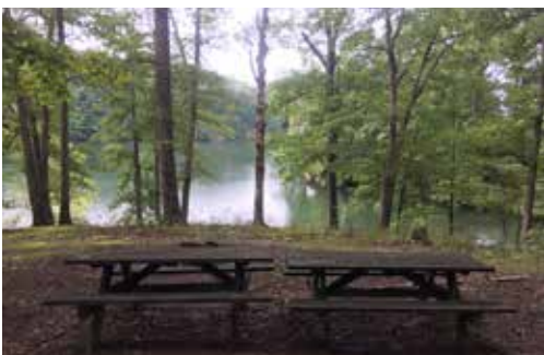
Wolf Run Lake

Ohio’s Noble County Airport, (I10) lies within Wolf Run State Park, 64 nm ESE of Columbus. The campground is on the shore of Wolf Run