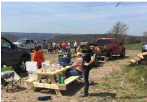
Volunteers install a fire ring at Trigger Gap, 2017

Most projects require the liaison to organize volunteer labor, and marshal RAF resources. Often material and equipment usage is donated. When products or services must be purchased, the emphasis is always on maximizing donors' contributions and deliver the best value on tangible improvements.