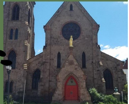
Cathedral of the Immaculate Conception 642 Market St, Camden