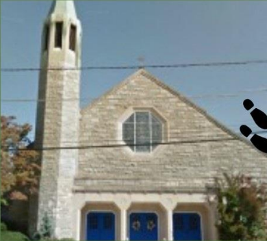
St. John's Church 809 Park Ave., Collingswood