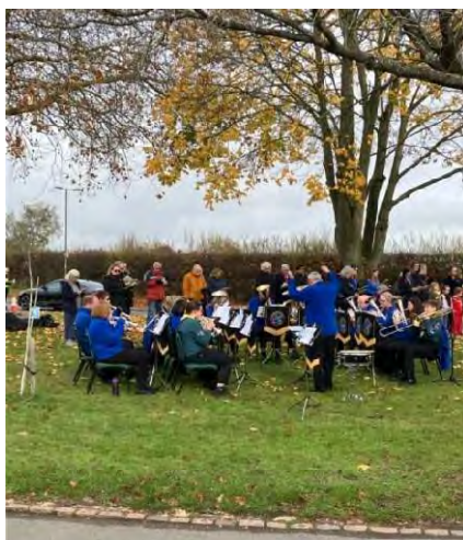
The Band on Remembrance Sunday