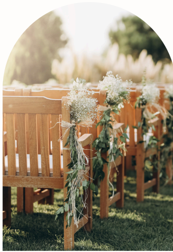
GOLD PACKAGE STARTING AT $65-$100PP

Buffet Service with choice of 2 apps, 1 salad, 1 entree and 2 sides add ons are available