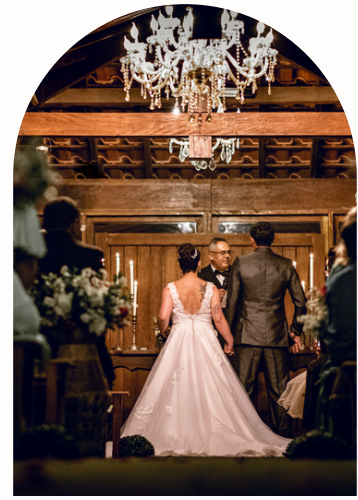
DIAMOND PACKAGE STARTING AT $80-$150PP

Buffet Service with choice of 3 apps, 1 salad, 2 entrees, 2 sides & dessert shooters add ons are available