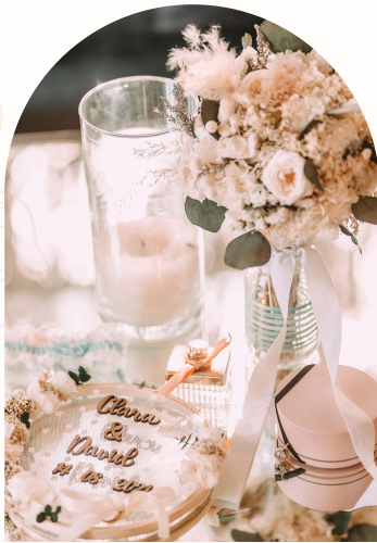
SILVER PACKAGE STARTING AT $50-$80PP

Embark on a culinary journey with our customizable catering packages. Our offerings are curated with an exquisite touch, ensuring a delightful fusion of flavors that will elevate your special day. We take pride in providing a range of flexible options, allowing for seamless personalization of menus tailored to your unique preferences and dietary requirements. Please feel free to reach out and request additions you do not see in our menu. Call/email/text us for pricing and drop off services. Pricing starts at $50 per person. 30 guests minimum. Final quote is based on your selected menu items and food costs. Feel free to ask for add ons menu items for these packages. Gratuity, Waitstaff and tax not included below.