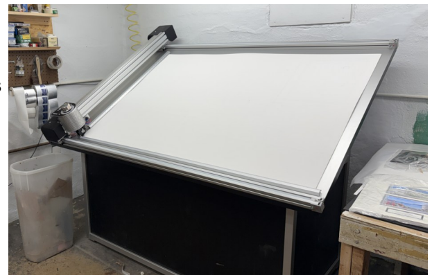
Grafica’s new Wizard 8000+

I t’s not Harry Potter, but we do have a WIZARD at Grafica now. A Wizard 8000+ has joined our team. It cuts the standard 45° bevel cutting, 45°+ deep bevel cutting, 90° straight cutting, and decorative debossing with this practical and efficient computerized mat cutter. Stay tuned for updates!