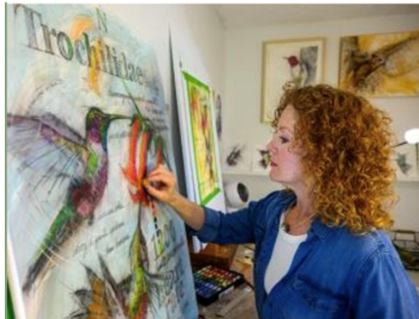
Artist at work