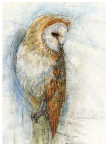
“Guardian” Barn Owl