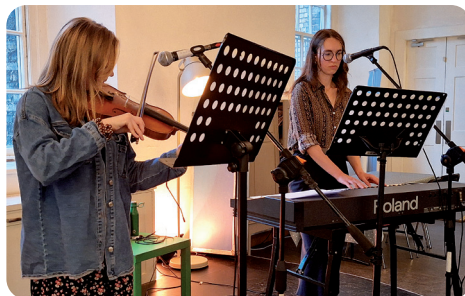
Photo: Worship at the night of prayer event.

Quiz d Who were the three speakers at our 'ReThinking Care for Vulnerable Children' conference? (see answer below)