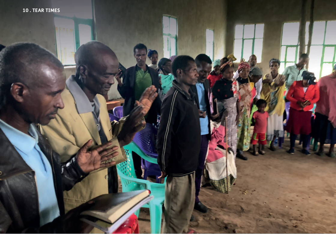
Photo: Praying during a church service in Ethiopia.