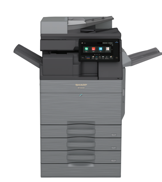
BP-50C65 shown with Inner Folding Unit, Right Side Exit Tray, and 2-drawer Paper Deck.