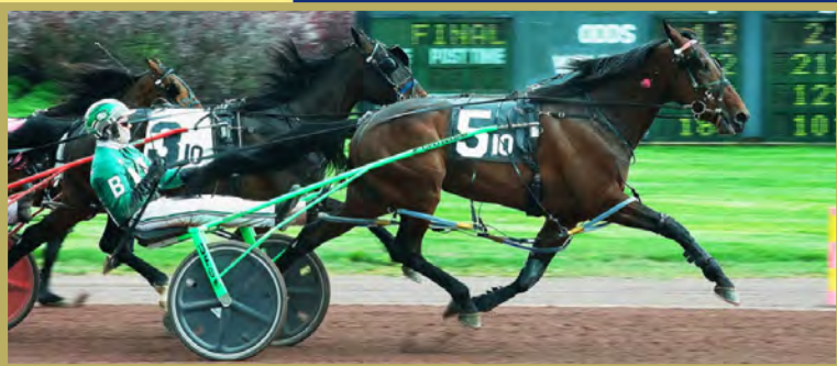
I WAS TRICKED P,3, 1:50.4F $104,868