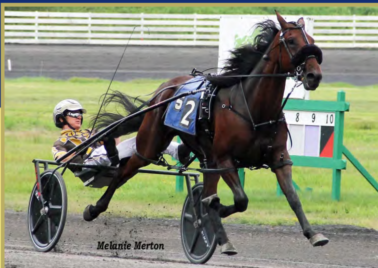
THUNDER HUNTER JOE P,3, 1:49.2S $177,716