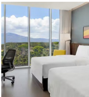
Hilton City Mall