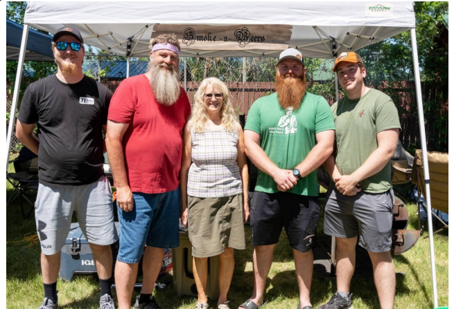
The two Little Flower teams who tied for 2 nd place in the 'Judges' Choice' category