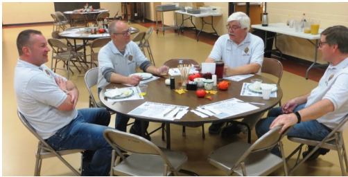
Knights enjoying each others company at our last breakfast

As it is the middle of winter and things seemed to have settled down with the holidays coming to an end, the kids going back to school, and having our lives as it seems go back to normal. We must not let this happen with our faith life though, beings that Christmas is over and the decorations are put away along with all the other traditions, we must not do the same with our faith. Instead we must grow more in our faith life, as one may say for our new year's resolution, go spend more time with Jesus in adoration, pray a little more in your daily life, and participate and volunteer more in the parish life. I can personally say that in doing so, you will only deepen the love in your catholic faith and bring more joy into one's life.