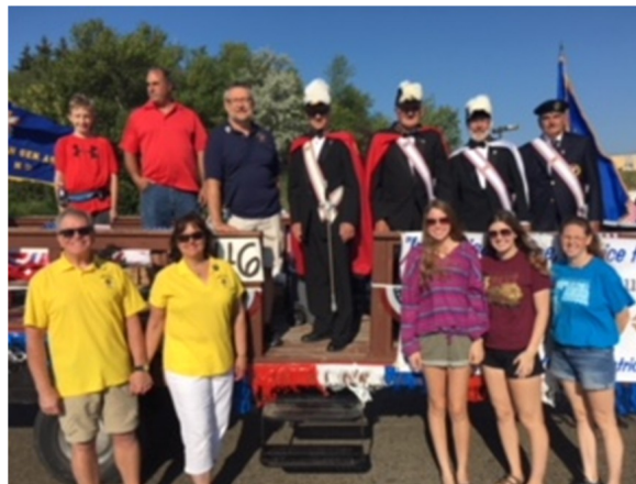
Minot Council 9906 parade float