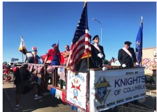
Minot Councils Brother Knights and Assembly Sir Knights float at the 2019 ND State Fair Parade.