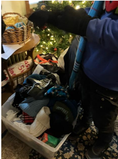
Hats, scarves, and gloves distributed in January — many hand-made by a parishioner at St. Demetrios Greek Orthodox Church in Union, NJ