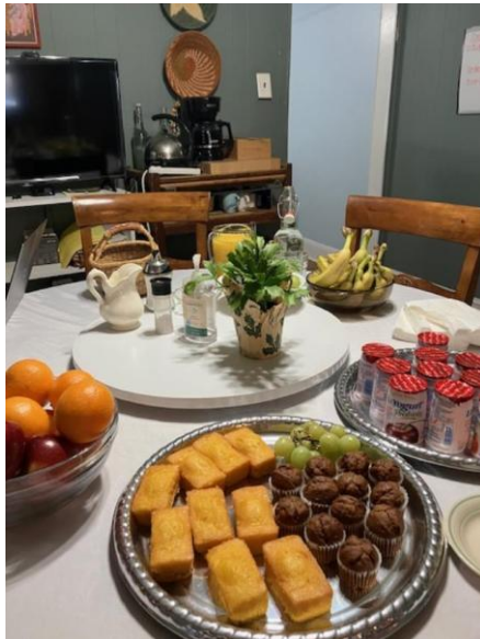
Some Saturday morning offerings