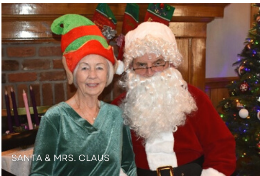
SANTA & MRS. CLAUS