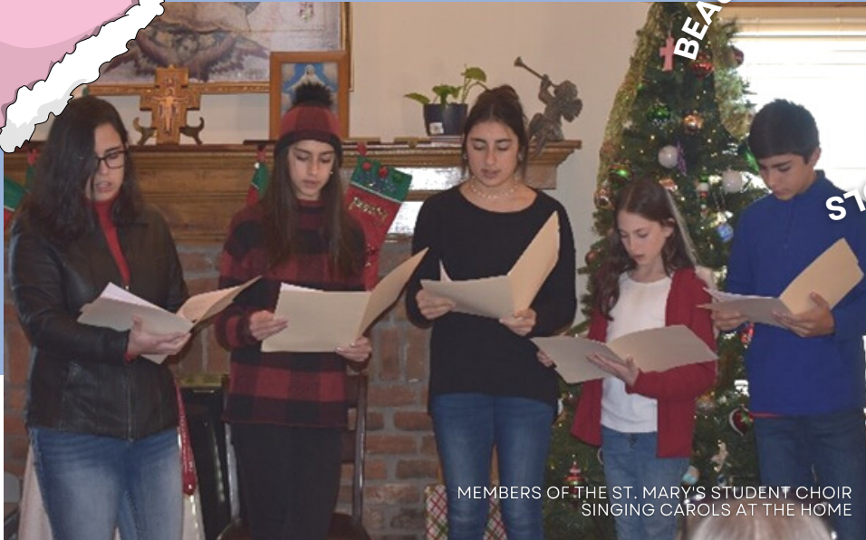
MEMBERS OF THE ST. MARY'S STUDENT CHOIR SINGING CAROLS AT THE HOME