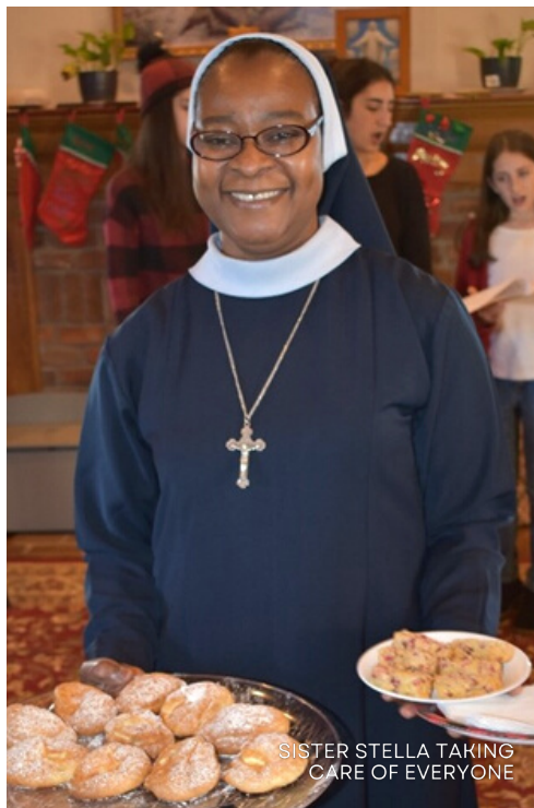
SISTER STELLA TAKING CARE OF EVERYONE