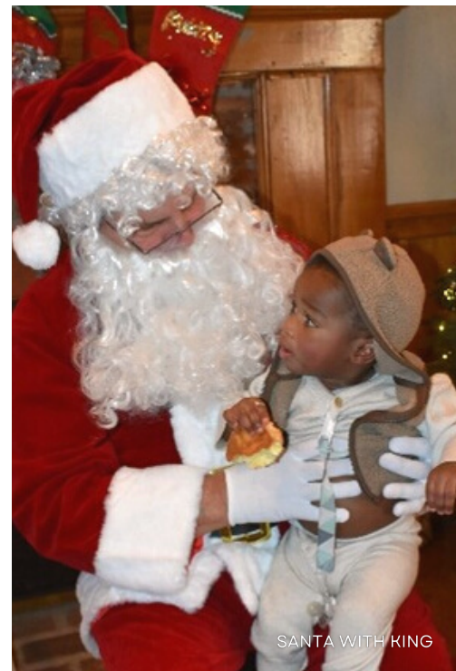
SANTA WITH KING