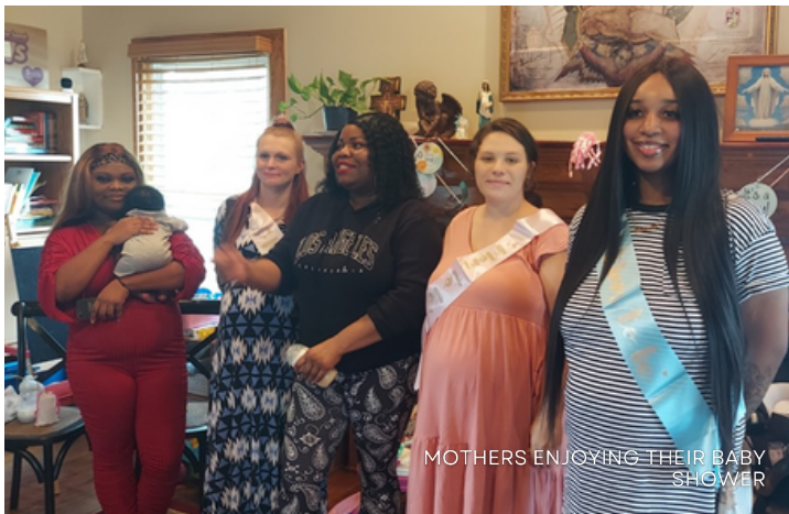
MOTHERS ENJOYING THEIR BABY SHOWER