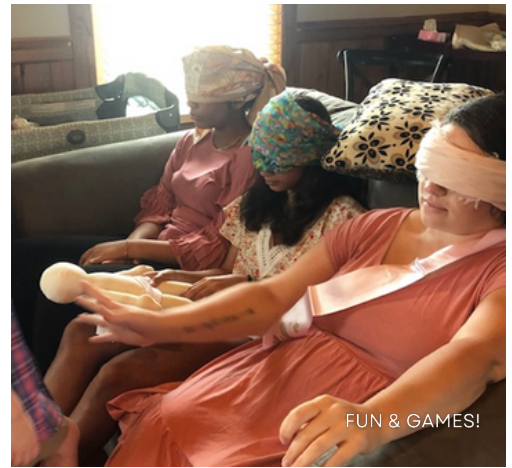
FUN & GAMES!