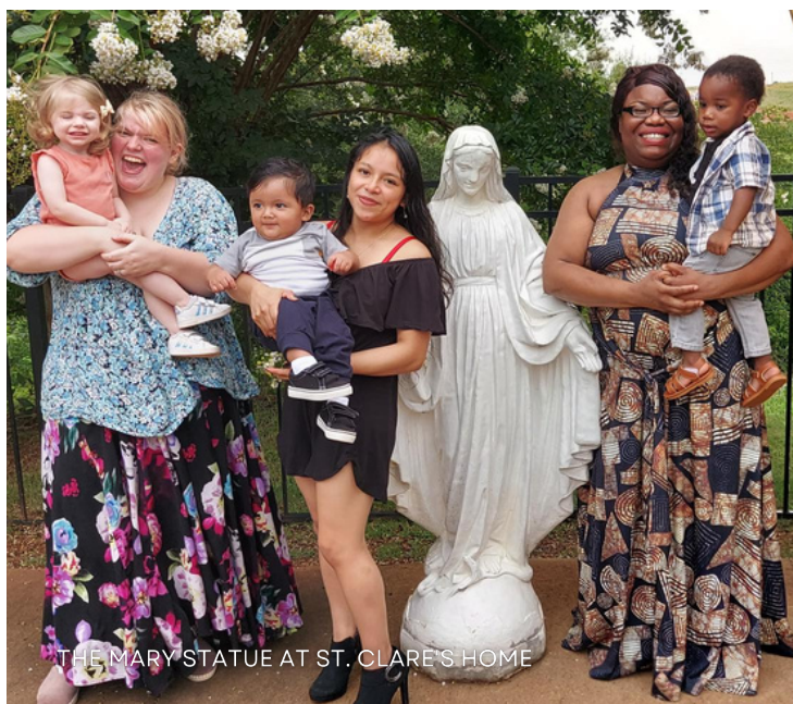
THE MARY STATUE AT ST. CLARE'S HOME