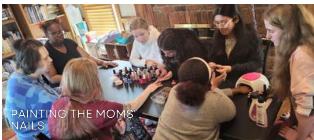
PAINTING THE MOMS' NAILS

The moms were so appreciative to have a work break, and they loved the homemade cookies and brownies! What a beautiful scene to see SJC students interact with our moms, pouring love and encouragement into them – they students were God's hands and feet. What a blessing!