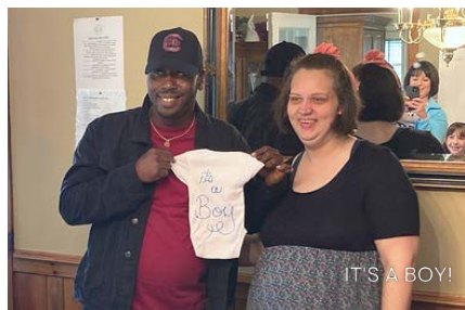
IT'S A BOY!