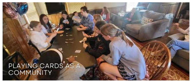
PLAYING CARDS AS A COMMUNITY