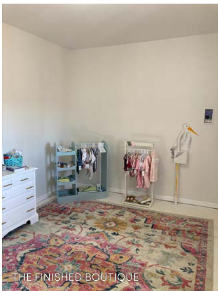
THE FINISHED BOUTIQUE

Additionally, they made a special embroidered gift for each of the current babies in the house and provided delicious food for our Christmas celebration with Santa. We thank all our volunteers and hope for many "bountiful blessings" in 2024!