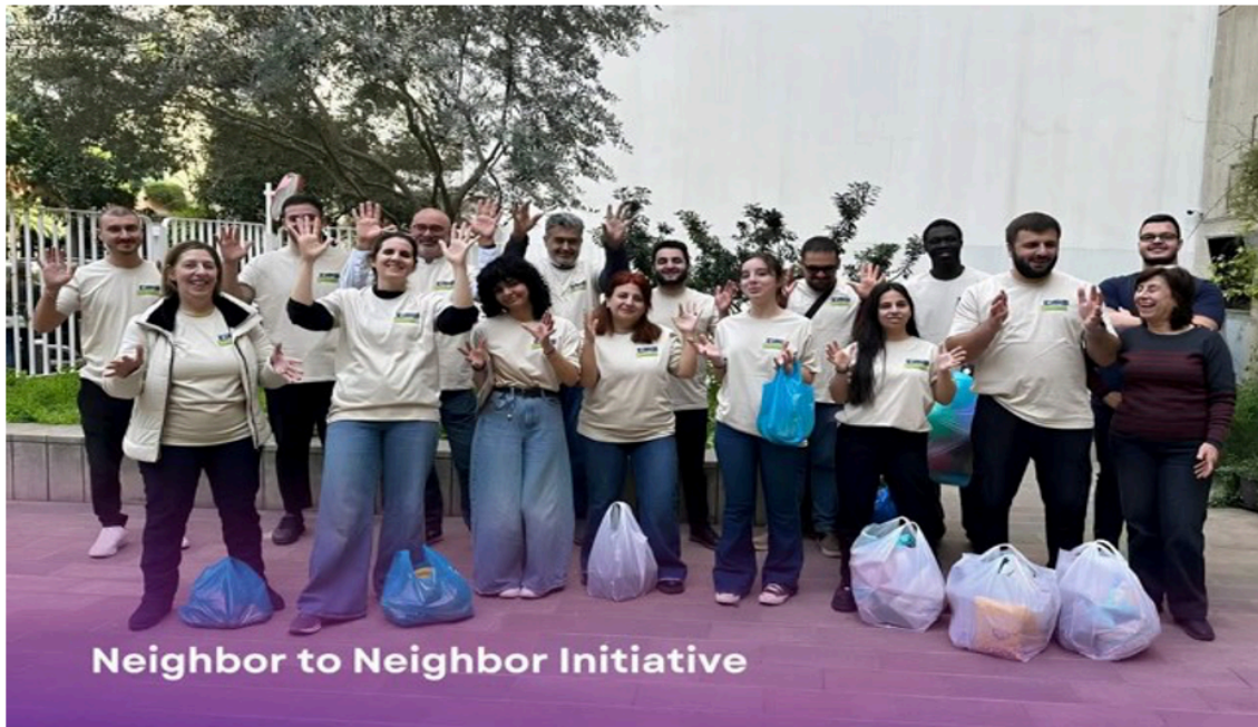
Near East School of Theology faculty and students reaching out to displaced Lebanese in their neighborhood

Friday evening, September 18th at 7:00 pm. Covenant Presbyterian Church, 1830 Celanese Road, Rock Hill, SC.