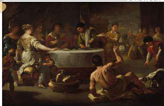
Dives and Lazarus Luca Giordano (1976)