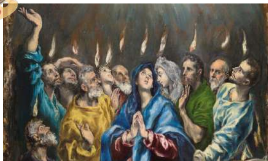
detail from Pentecost - El Greco (~1600)

The parish office will be closed on Monday, 25 MAY 2026 for Memorial Day.