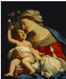
"Virgin and Child" -- Elisabetta Sirani (~1660)

Please pray for those in need of physical or spiritual healing