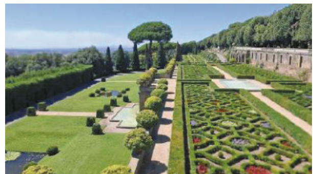
Laudato Si' Village Gardens

Pope Leo XIV travelled to Castel Gandolfo on Friday, 05 SEP 2025 , to inaugurate a new initiative that brings faith, education, and ecology together. The Holy Father has formally opened the Borgo Laudato Si' , a village dedicated to living out the vision of Laudato si' , Pope Francis' encyclical on care for creation. The Borgo , whose name means "village" in Italian, occupies 135 acres of the papal residence at Castel Gandolfo. It blends villas, gardens, archeological sites, and farmland into a space intended not only for visitors, but for prayer, study, and community life.