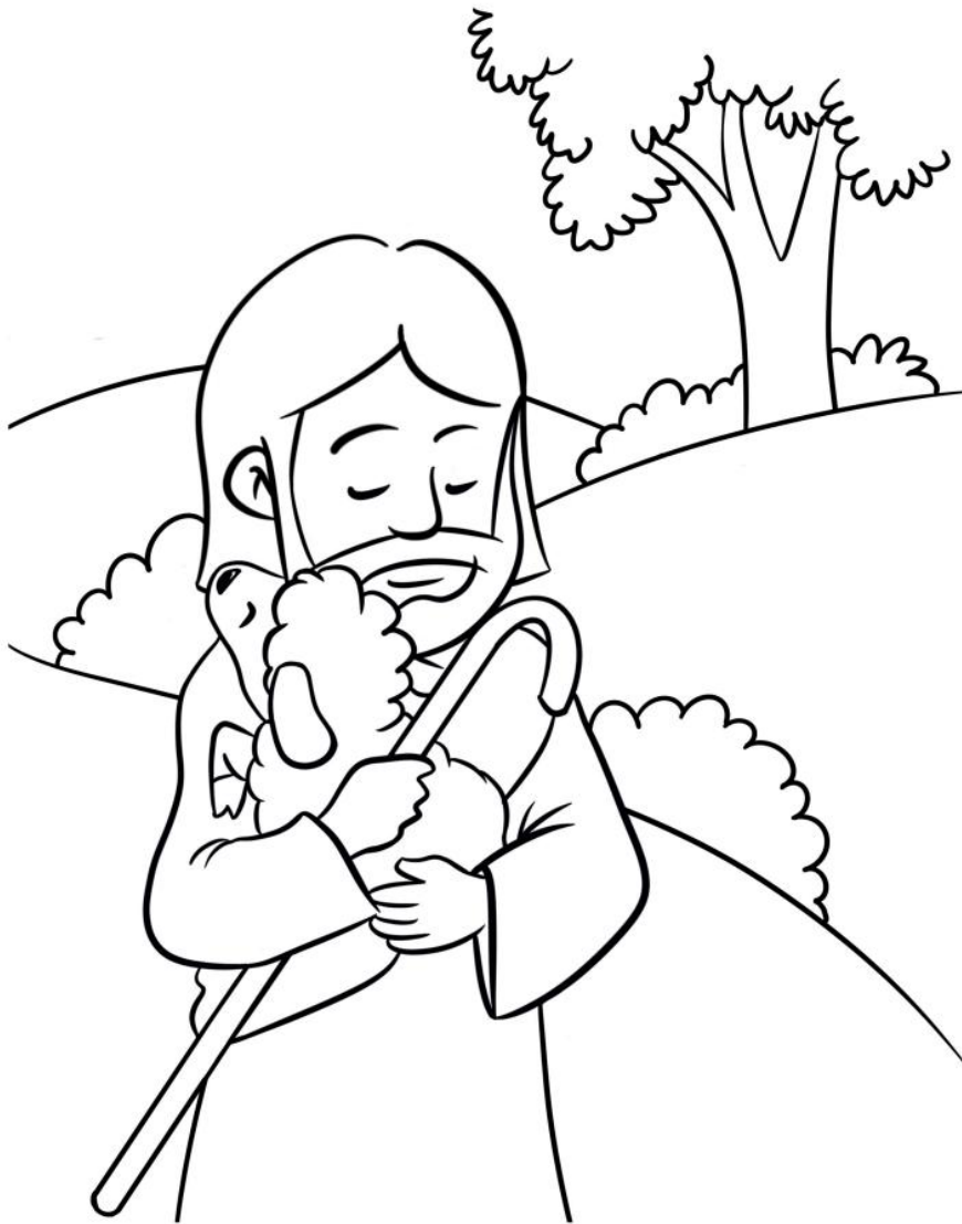
The Parable of the Lost Sheep