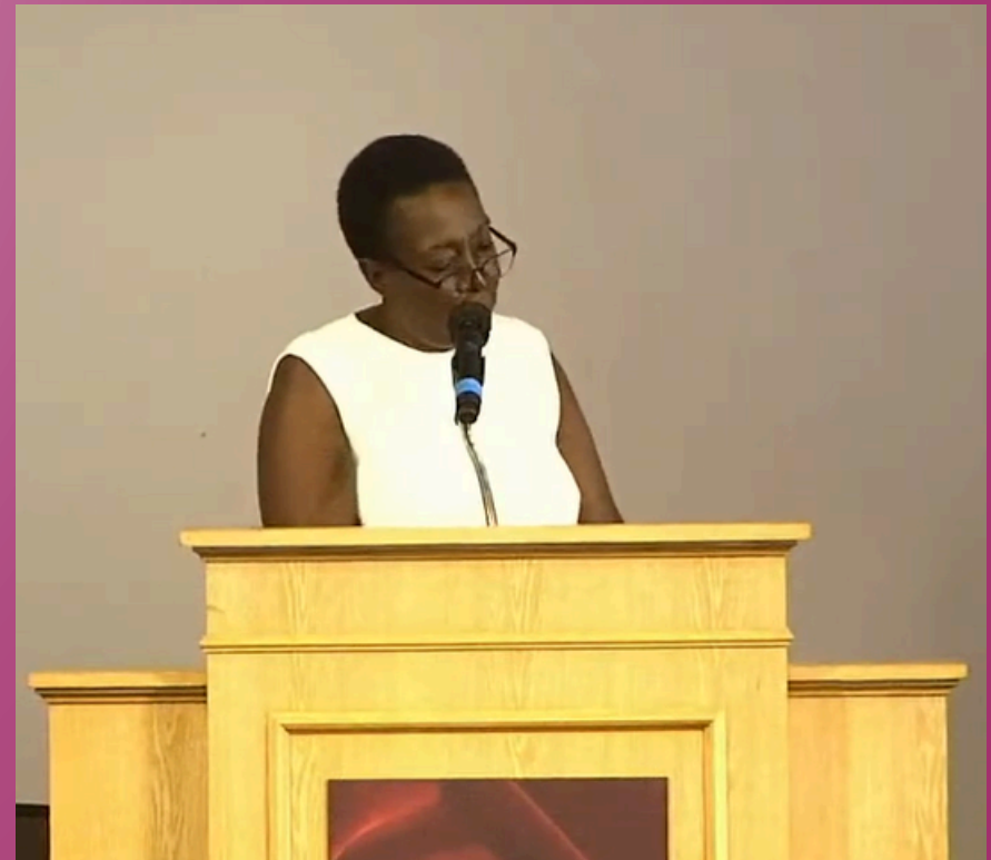
Victimized, Violated, and Victorious