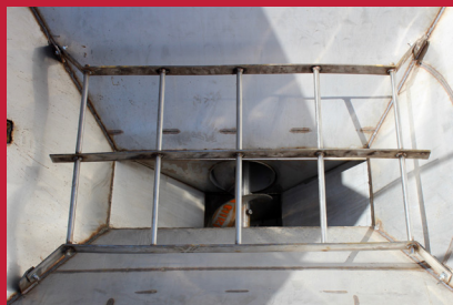
Stainless Hopper Grates