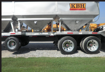
Optional Aluminum Wheels, Axle Configurations and Trailer Lengths!