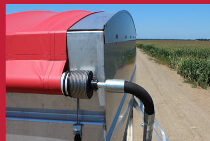
SRT Spring Assist Tarp/Optional Electric