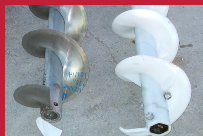
Standard Stainless/Optional Poly-cupped