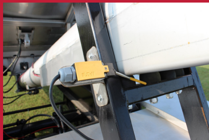
Auger Transport Alarm