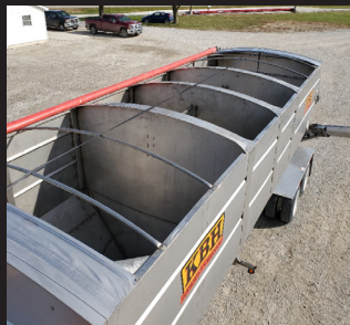
Optional Split Hoppers with Full-Height Dividers