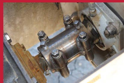
Two-Piece Bolted Auger Couplers