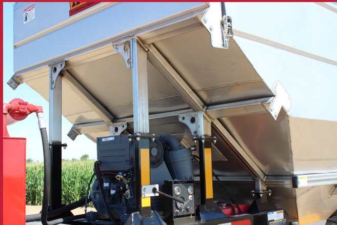
Bolted Stainless Hopper Cradle