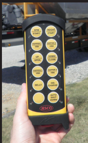
Optional Wireless Remote