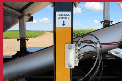
Remote Grease Zerk Station