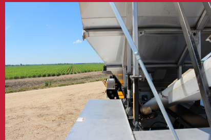
Steep Hopper Slopes