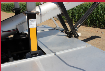
Rear Fenders and Axle Cover