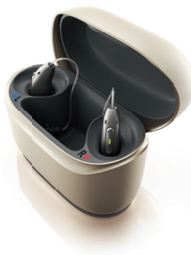
Phonak Charger RIC Infinio for cable charging