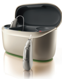
Phonak ChargerGo RIC Infinio with built in battery for charging on the go