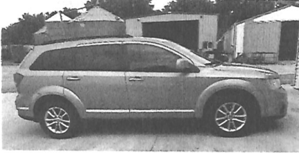
2015 Dodge Journey

Serving grilled sandwiches, chips, sweets & more!