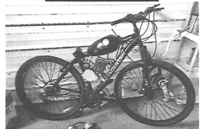
Motorized Mountain Bike

MANY MORE TREASURES TOO NUMEROUS TO LIST—CHECK IT OUT!