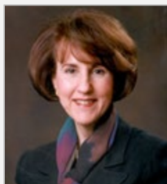
Ambassador Charlene Barshefsky U.S. Trade Representative