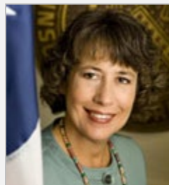
Sheila C. Bair Chairman Federal Deposit Insurance Corporation