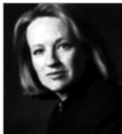
Mary L. Schapiro President NASD Regulation, Inc.