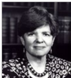
Alice M. Rivlin Vice Chair, Board of Governors Federal Reserve System