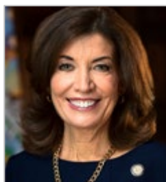
Kathy Hochul New York State Lieutenant Governor