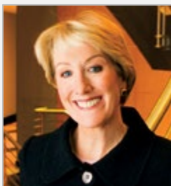
Anne M. Mulcahy Chairman & CEO Xerox Corporation