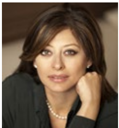
Maria Bartiromo CNBC's "Closing Bell" Anchor/Managing Editor , "Wall Street Journal Report with Maria Bartiromo"