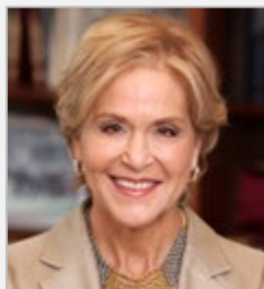
Judith Rodin, Ph.D. President The Rockefeller Foundation