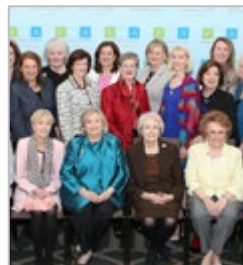
FWA's Past Presidents