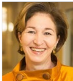
Anne-Marie Slaughter President and CEO New America