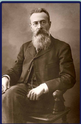
Nikolay Rimsky Korsakov