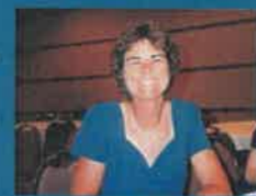
August 16, 1953 - August 19, 2022