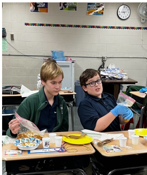
Christian and Noel digesting food in the stomach.