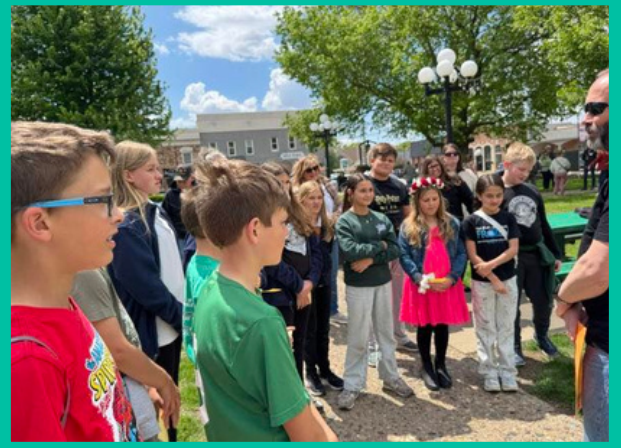
5th Grade attended the Day of Prayer in the Washington Square.