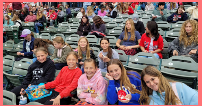
5th-8 th grade attended Education Day at Dozer Park!