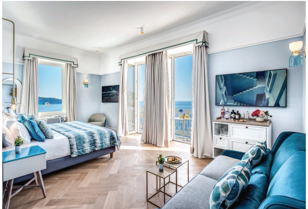
HOTEL MEDITERRANEO SORRENTO's Sunset Junior Suite is spread over 485 square feet of space. It has two balconies and a couch that can turn into a bed.