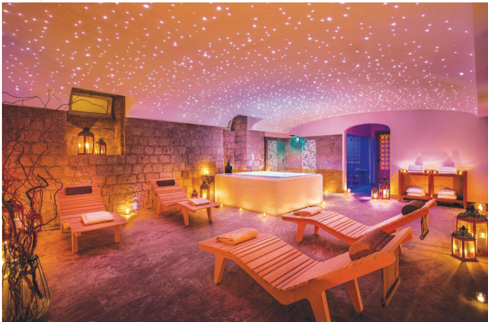
THE LEPIETRE COZY SPA has two treatment rooms, a sauna, Turkish bath, Jacuzzi, and a relaxation area as well as a salt room, used also for couples' massages.

Sorrento is five minutes away on the half-hourly hotel shuttle and, like all the little coastal towns is packed with outdoor cafés, restaurants and crowded shopping streets. To see how limoncello is made, a visit to I Giardini di Cataldo is a great experience, and for Sorrento's