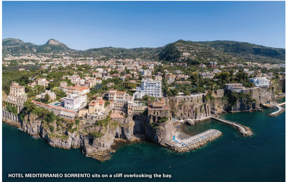
HOTEL MEDITERRANEO SORRENTO sits on a cliff overlooking the bay.