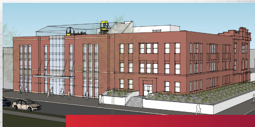
ST. PETER SCHOOL - FUTURE