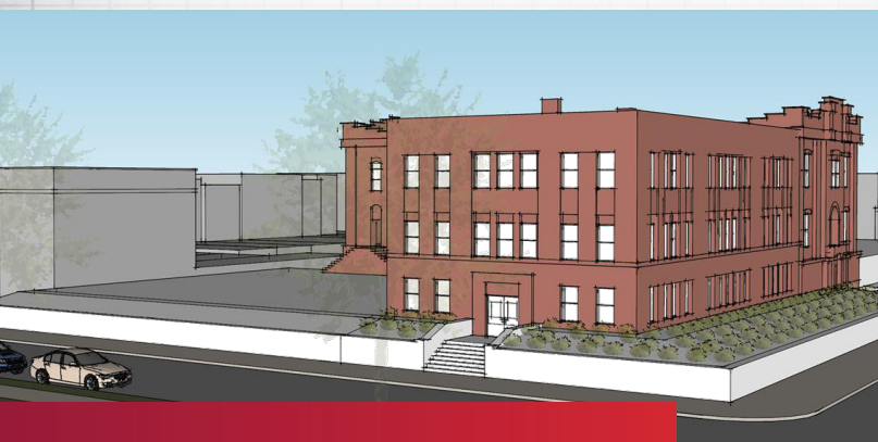
ST. PETER SCHOOL - PRESENT