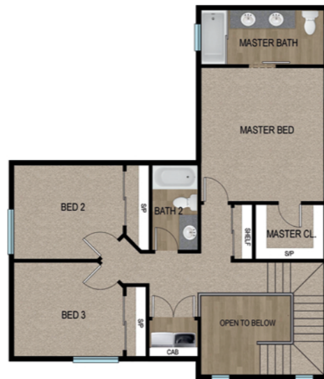
2nd Story Floor Plan