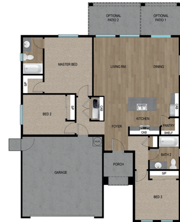
Single Story Floor Plan