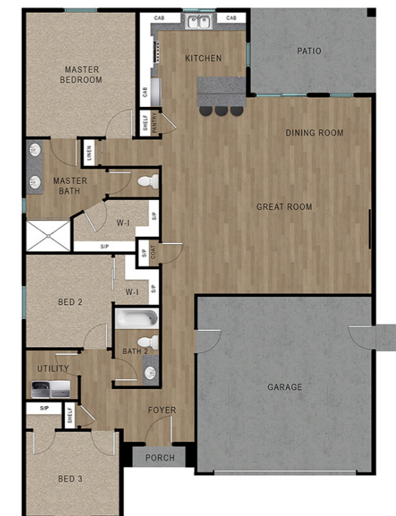
The 1600 2D Floor Plan

1600 sq.ft. - 3 bedroom / 2.5 bathroom + Den / 4th bedroom