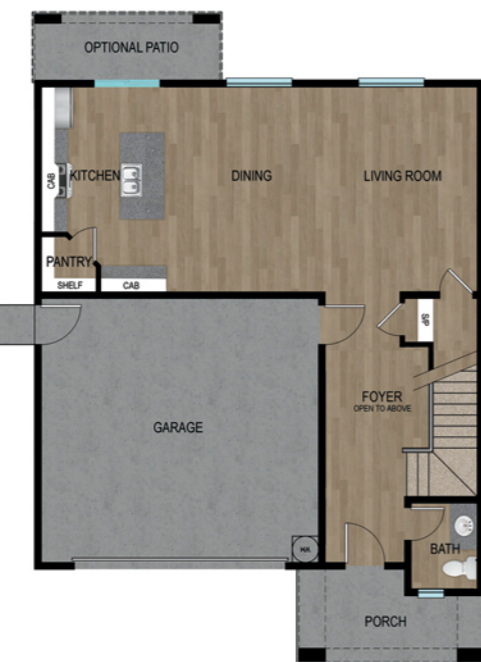
1st Story Floor Plan