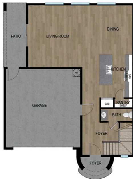
1st Story Floor Plan