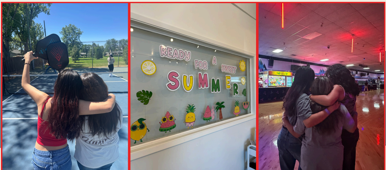
Awaken Summer Healing & Resilience Program

Because of this support, the Summer Healing and Resilience Program served 14 participants and their 7 children, offering a season of healing, joy, and renewed hope. Awaken is deeply grateful to the multiple Foundations for making this transformative program possible and for investing in experiences that restore childhood, strengthen resilience, and build pathways to lasting freedom.