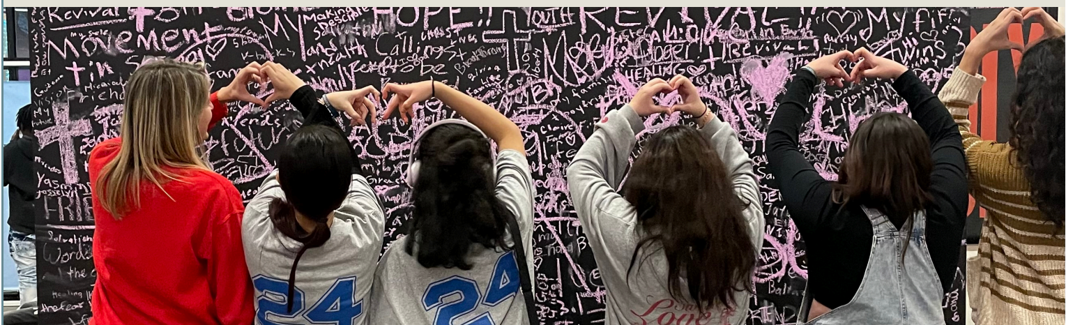
Awaken Youth Program Participants Attending Jesus Culture Youth Conference

Total People Reached Through Educational Efforts