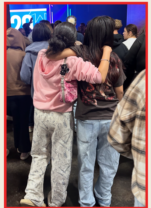
Awaken Youth Program Participants at Jesus Culture Youth Conference

Awaken launched a new partnership with Willow Springs , supporting the development of a dedicated recovery wing for girls who have experienced trafficking. Through this partnership, Awaken staff will engage with youth from the earliest stages of recovery building trust, supporting healing, and ensuring successful transitions into long-term restoration programs. This collaboration represents meaningful, systemic change at the intersection of crisis response and sustained care.