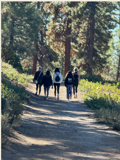
Youth & Adult Program Participants Nevada Day

Awaken strengthened our approach to restoration by hiring a Community Outreach Director. This position works alongside our case managers to provide additional relational support to participants and their families, particularly when children, partners, or spouses are part of the healing journey. Recognizing the importance of healthy male presence, Awaken has built and led a dedicated team of men who volunteer their time to model consistency, respect, and positive masculinity. Together, they create welcoming spaces through family-centered activities. This team also offers mentorship to partners and boyfriends, helping reinforce healthy relationships and supportive family dynamics with healthy men. This intentional investment in safe, positive male role models has become a meaningful extension of Awaken's commitment to whole-family healing.