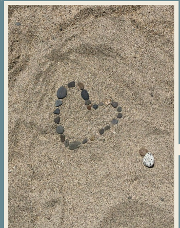
Awaken Summer Healing & Resilience Program