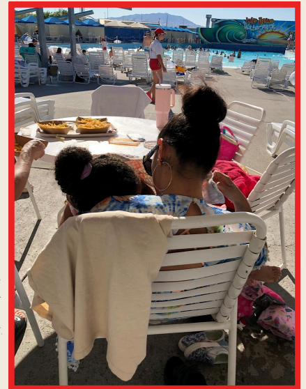
Awaken Adult Participant and Child at Empowerment Program Wild Water Day