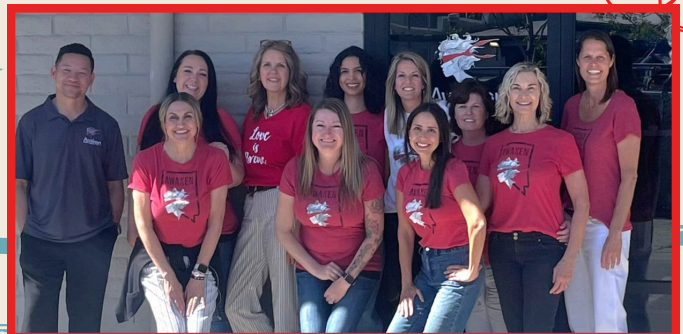
Awaken Staff at the Spring Volunteer Appreciation Gathering