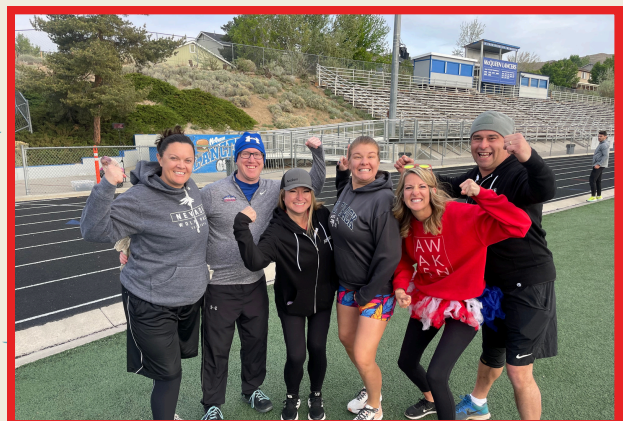
Kaia Fit Burpee Mile Fundraiser